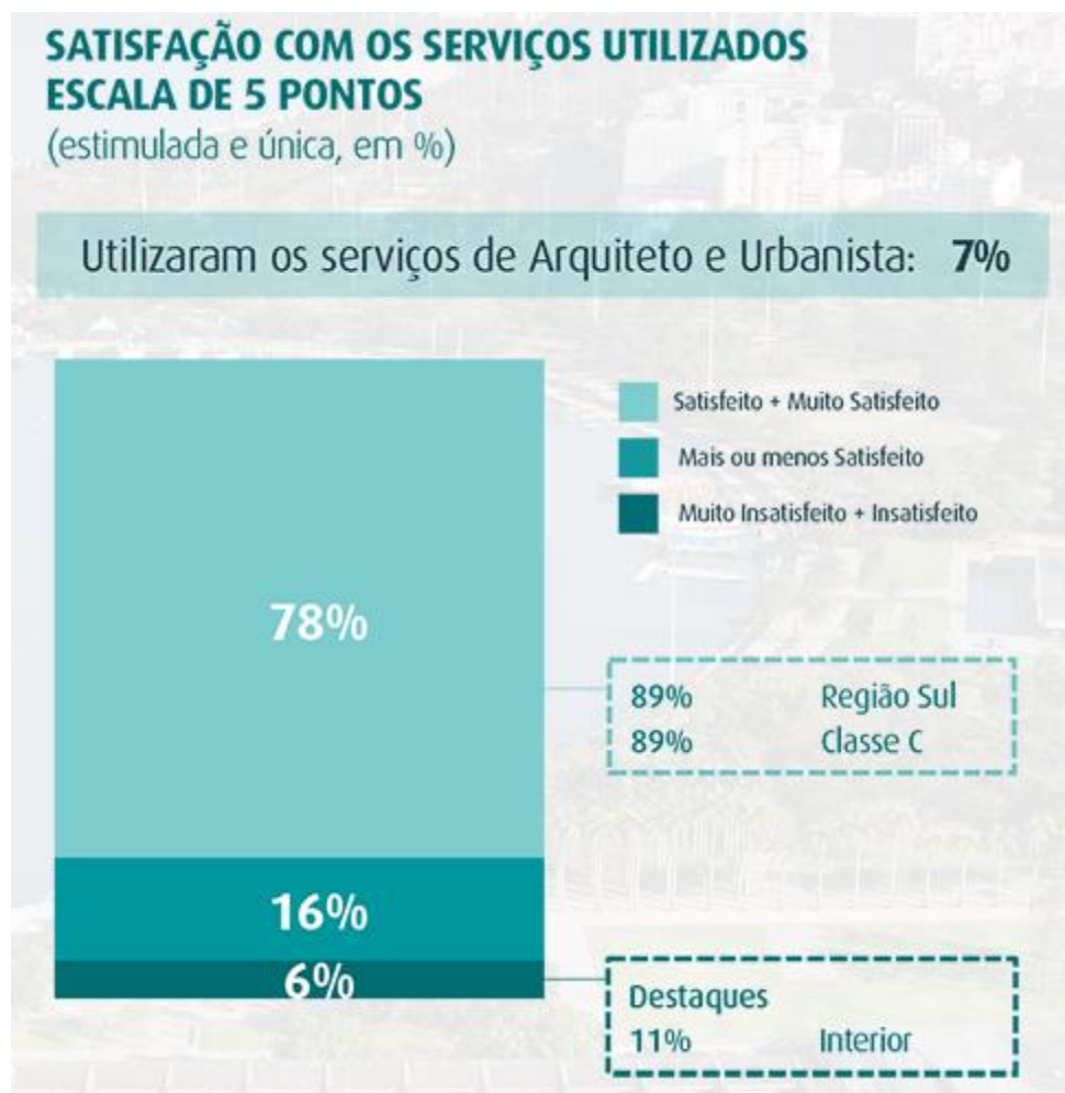
Figure 2 (in Portuguese) – Index of satisfaction with the services provided by Architect and Urbanist.

Despite the alarming data presented at the beginning of the article, showing that only 15% of people turned to architecture professionals to carry out their construction or renovation (and only 7% of the economically active population used the service of architect), a part of the research conducted by the Datafolha Institute reveals the advantages of hiring an architect. Among those who hired services, satisfaction is expressive: eight out of ten say they are satisfied with the work of architecture and urbanist professionals (Figure 2).